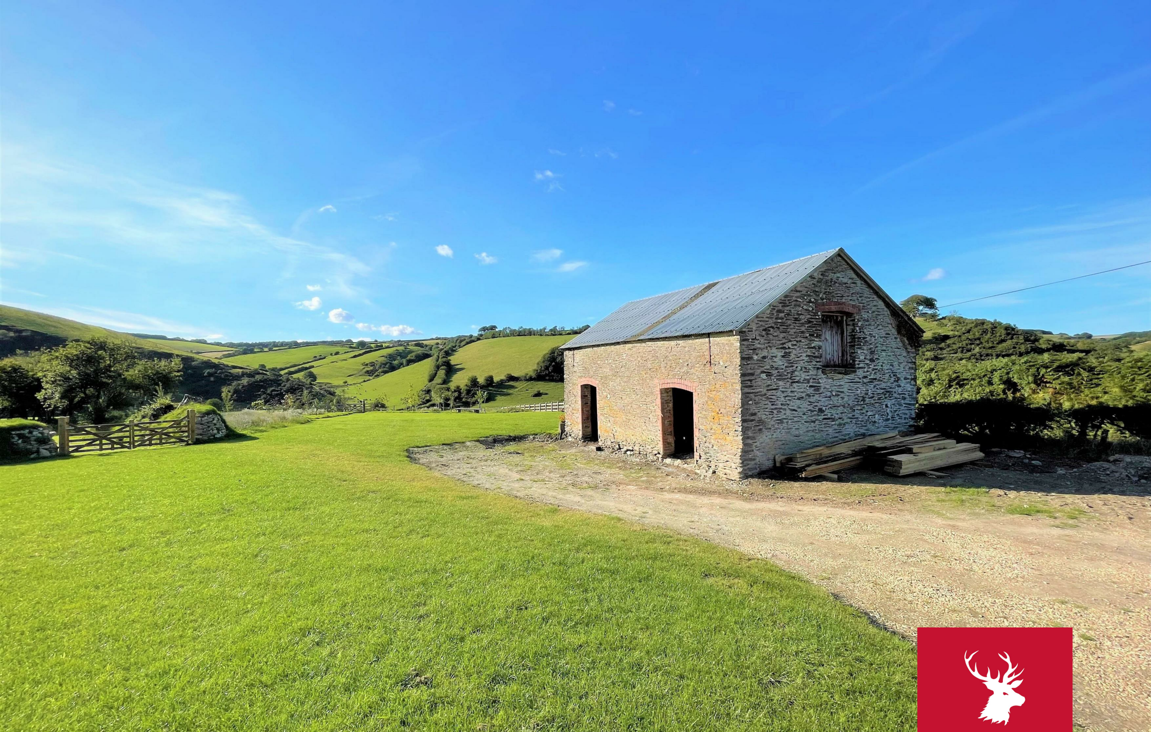
Berry Wood Barn